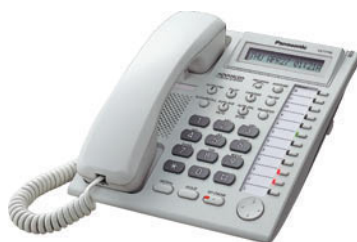
■ KX-T7730 LCD, Speakerphone Unit