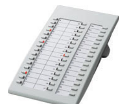
■ KX-T7740 DSS Console