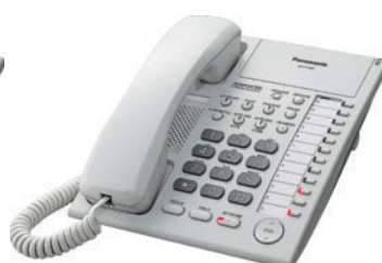
■ KX-T7720 Speakerphone Unit